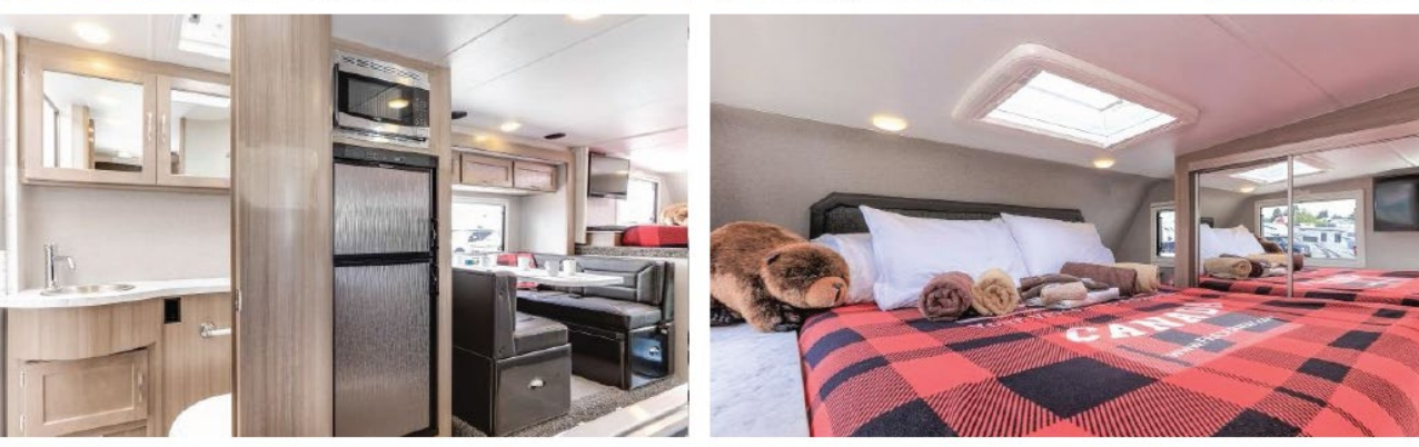
FLOOR PLANS, VEHICLE FEATURES AND SPECIFICATIONS ARE SUBJECT TO CHANGES WITHOUT NOTICE.