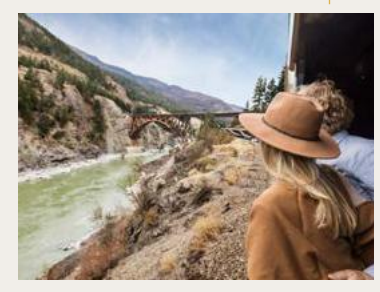
Exclusive outdoor viewing platform