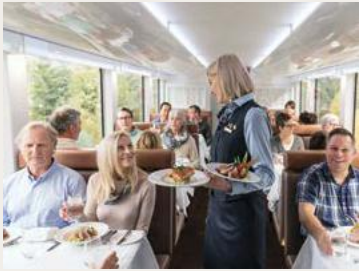
Dining area below