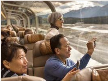
Guest seating above