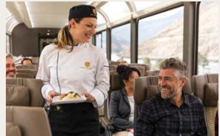
Seat-side meal service