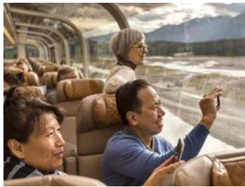
Guest seating above