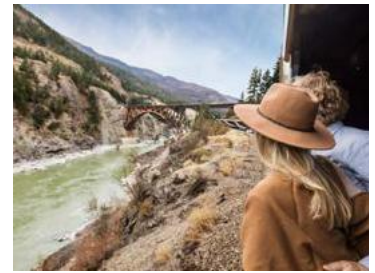
Exclusive outdoor viewing platform