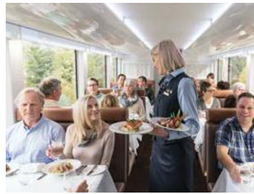
Dining area below